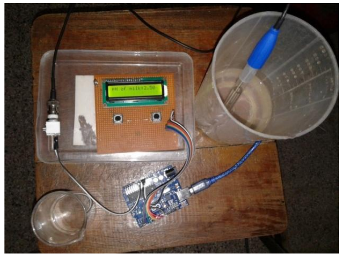
Fig.4: The pH measurement setup

The pH sensor MS pH 07 is implemented for pH measurement. The output voltage (analog) of the sensor is proportional to the pH value of the milk. The sensor is first calibrated using standard sample (distilled water). The Arduino Uno microcontroller has built-in analog to digital convertor (ADC). The pH sensor output is fed to analog input pin A0 of the microcontroller. The algorithm allows reading the pH value and displaying it on the LCD panel. The experimental setup for pH measurement is as shown in fig.4.The reading set comprised of 20 readings of the same quality sample and volumetric dilution of sample is done by mixing measured quantity of adulterant in it.