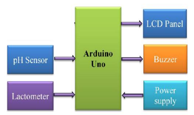
Figure2: Block diagram of Milk parameter measurement system

This microcontroller comes from a company called Atmel and the chip is known as an AVR. It is slow in modern terms, running at only 16Mhz with an 8-bit core, and has a very limited amount of available memory, with 32kilobytes of storage and 2 kilobytes of random access memory. The interfaceboard is known for its rather quirky design—just ask the die-hards about standardized pin spacing—butit also epitomizes the minimalist mantra of only making things as complicated as they absolutely need tobe. Its design is not entirely new or revolutionary, beginning with a curious merger of two, off-the-shelfreference designs, one for an inexpensive microcontroller and the other for a USB-to-serial converter, with a handful of other useful components all wrapped up in a single board. Its predecessors include thevenerable BASIC Stamp, which got its start as early as 1992, as well as the OOPic, Basic ATOM, BASICX24, and the PICAXE.